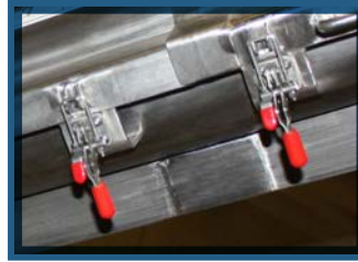
Quick Access Clamps