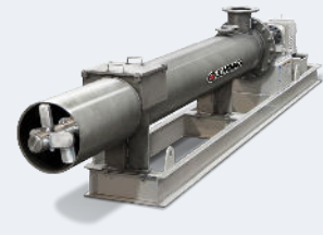
Continuous Simplex Mixer