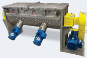
Thermal Heating & Cooling

S. Howes provides reliable and efficient industrial mixers to mix and blend biofuel and biomass feedstocks. Batch and continuous mixers are available in various configurations and are customized for each application.