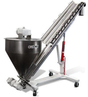
Split Tube Conveyor