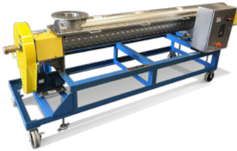
Thermal U-Trough Conveyor

S. Howes provides thermal screw conveyors for heating and drying hemp applications. Available in several designs including u-trough, split tube, and tubular conveyors.