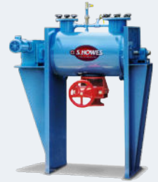
Vaccum & Drying