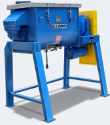
Jacketed Processing Mixer

S. Howes' mixers have robust and heavy-duty construction and are built with proven designs to deliver superior, uniform mixing and blending. Batch, continuous, ribbon, paddle and custom agitator mixing designs are available for your oil and gas processing needs.