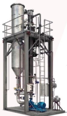
Distillation Systems & Heat Transfer Equipment