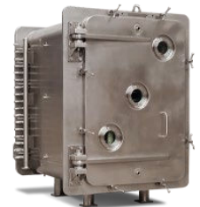
Vacuum Shelf Dryer