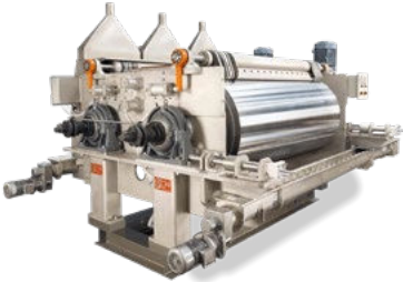
Atmospheric Double Drum Dryer

Our dryers and cooling flakers are designed and built for performance, precision and reliability. Atmospheric Drum Dryers are available in Single, Double and Twin Drum designs. Vacuum Dryers include Double Drum, Rotary, Pan/Kettle and Shelf designs. Single Drum Cooling Flakers are available for flaking and solidification.