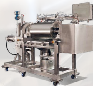
Cooling Drum Flaker