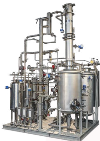
Forced Circulation Evaporators