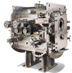
Vacuum Double Drum Dryer