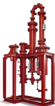
Natural Circulation Rising Film Evaporators