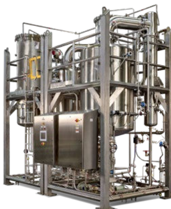
Rising Falling Film Evaporators