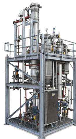
Falling Film Evaporators