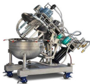
Vacuum Pan (Kettle) Dryer