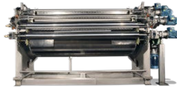
Atmospheric Single Drum Dryer