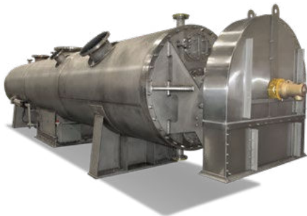
Vacuum Rotary Dryer